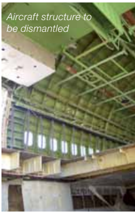
Aircraft structure to be dismantled

On the other side, the new technologies are evaluated and monitored through system level activities: the eco-statement mainly based on Life Cycle Analysis (LCA), producing the life-cycle assessment. The LCA of a product is based on the representation of the aircraft life through a succession of unit steps at all level of the aircraft integration, from individual pieces up to the aircraft. Examples of such steps are machining, drilling of mechanical parts, assembly, painting, dismantling, etc. The LCA tools produce for each step the quantified environmental impacts by using a LCA database on processes and then the environmental impact results at each level of the product tree, up to the complete aircraft.