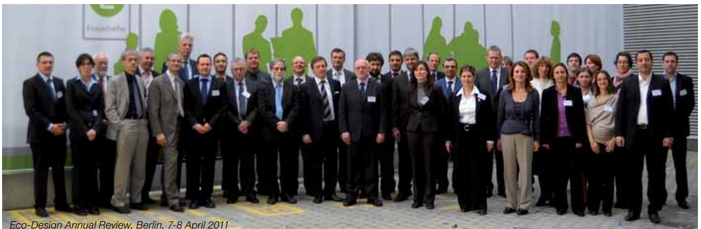
Eco-Design Annual Review, Berlin, 7-8 April 2011