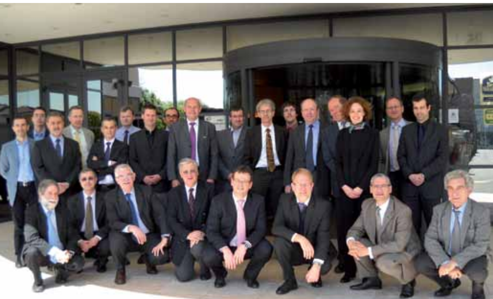
GRC Annual Review, Milano, 4-5 April 2011

Executive Director of the Clean Sky Joint Undertaking