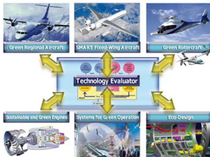
Figure 1: Clean Sky six Integrated Technology Demonstrators and the Technology Evaluator

In order to quantify the performance of the different ITDs, a Technology Evaluator will be developed.